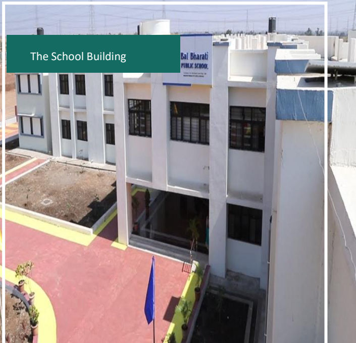
The School Building

Our aim at Bal Bharati Public School, Kudgi is to lay the foundation strong and firm right from primary to upper primary and middle school which provide space for children to explore and develop rational thinking that they would imbibe in them and have sufficient knowledge of concepts, language, knowledge, investigation and validation procedures. Besides academic excellence and intellectual development, we are making constant and unrelenting efforts to help each child discover and develop their innate talents and abilities.